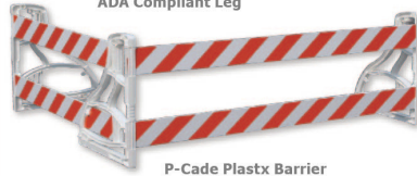
P-Cade Plastx Barrier